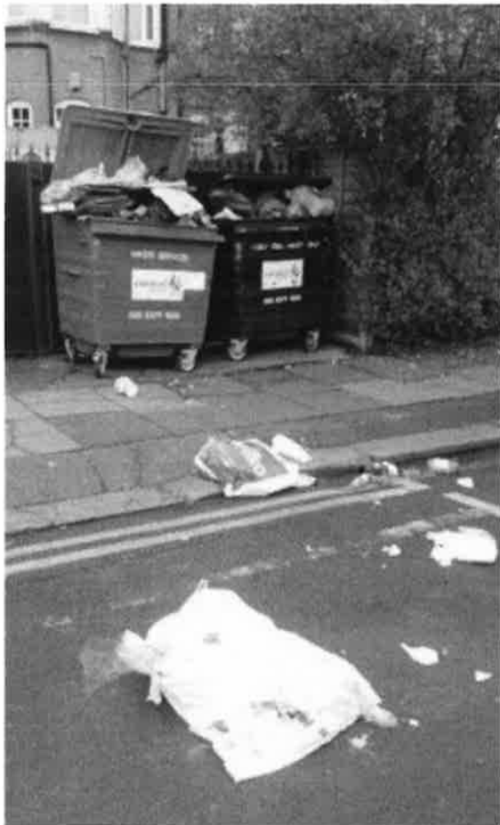
The blue bin belonging to 740 used to be stored in the road (below) and is now stored on land belonging to 736 (Left)