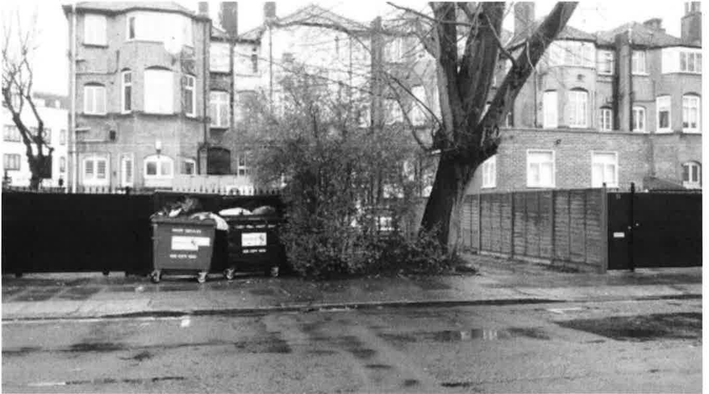
Rear of 740 Green Lanes showing the new building